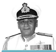
Admiral (Retd) Sunil Lanba

Chairman, National Maritime Foundation (NMF); Former Chief of the Naval Staff, India