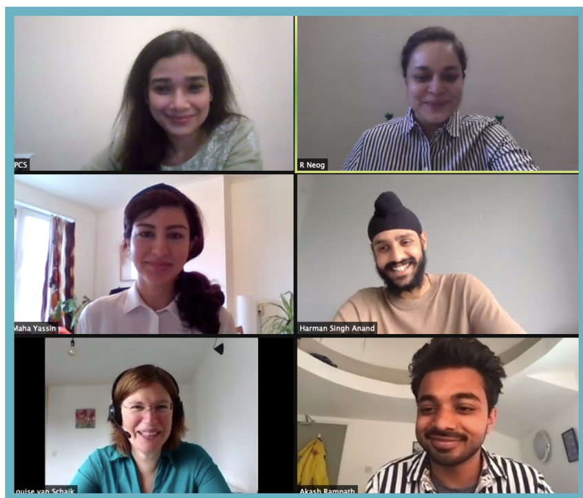
Bi-weekly IPCS-Clingendael project meetings