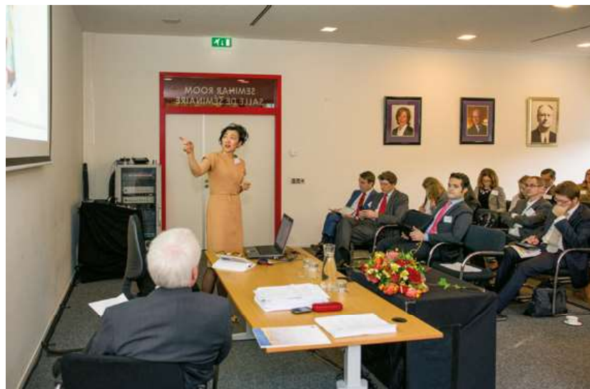
Working Group 7. Arabian Peninsula

Firstly, we must work to support efforts of diversification of the economy. Although this is not novel in the Gulf region, new generations look more ready for a new economic model that can gradually move from over reliance on resource depletion. Secondly, we must work with Gulf countries on building resilience to shocks and setting a better resilience infrastructure. Thirdly, we must work to facilitate regional collaborations and empower regional structures such as the Gulf Cooperation Council (GCC). EU and China can possibly work jointly to propagate such ideas in Gulf countries. This can start by getting Gulf states more involved in the forthcoming Paris Meeting and press them on their pledges to meet CO 2 reduction targets post-Paris.